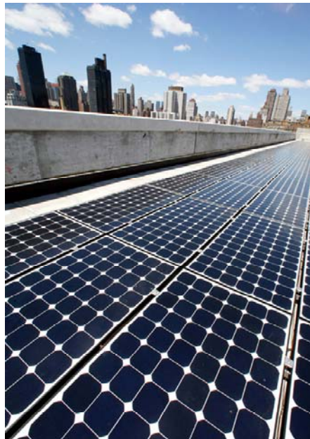
Solar Photovoltaic Installation on Roosevelt Island, New York City

A New York State Energy Plan was adopted in late 2009. The Plan establishes a framework of policy objectives and strategic recommendations to be implemented over a long term period within which the state will reliably meet its future energy needs in a cost-effective manner. The NYSRC served as a source of information for development of the Plan. The recommendations in the New York State Energy Plan are being implemented by a series of actions. Those actions that would affect the state's bulk electricity system have been identified and are being monitored by the NYSRC.