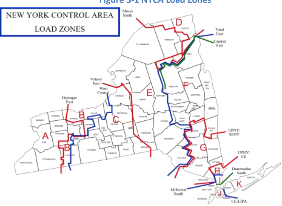
Figure 3-1 NYCA Load Zones

initial LCRs, as illustrated in Figure 3-2. All points on these curves meet the NYSRC 0.1 Event-Days/year LOLE reliability criterion described in Section 2. Note that the area above the curve is more reliable than the criterion, and the area below the curve is less reliable. This methodology develops a pair of curves for two zones with locational capacity requirements, New York City (NYC), Zone J; and Long Island (LI), Zone K. Appendix A of NYSRC Policy 5-16 provides a more detailed description of the Unified Methodology.